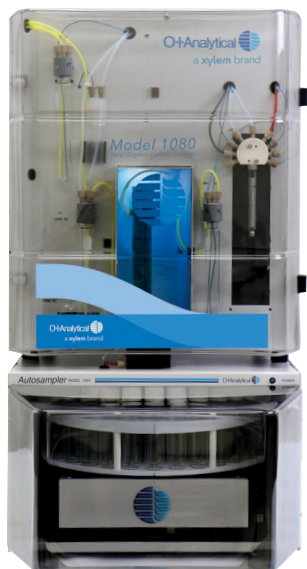
1080 TOC Analyzer